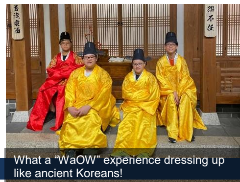
What a "WaOW" experience dressing up like ancient Koreans!

In my not yet faded memory, I recalled the best thing I did in Seoul was going to the Mapo Agricultural & Marine Products Market, where I spent most of my Won. We were like a bunch of 'Ajumma' (middle-aged woman in Korean), shopping and bargaining in such a clamorous place. It was my first ever shopping experience all by myself, by that, I mean no parents. We were so excited as if we were fighting for some kind of limited-edition luxury goods. However, what we were fighting for were just packets of kimchi, shredded squid and other snacks...The scene was truly funny and memorable!