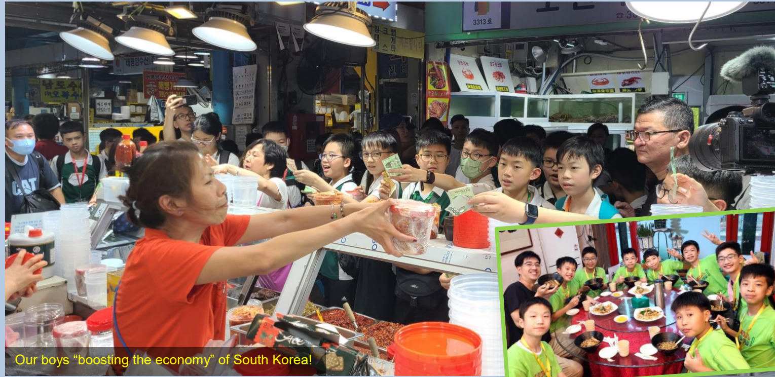
Our boys "boosting the economy" of South Korea!