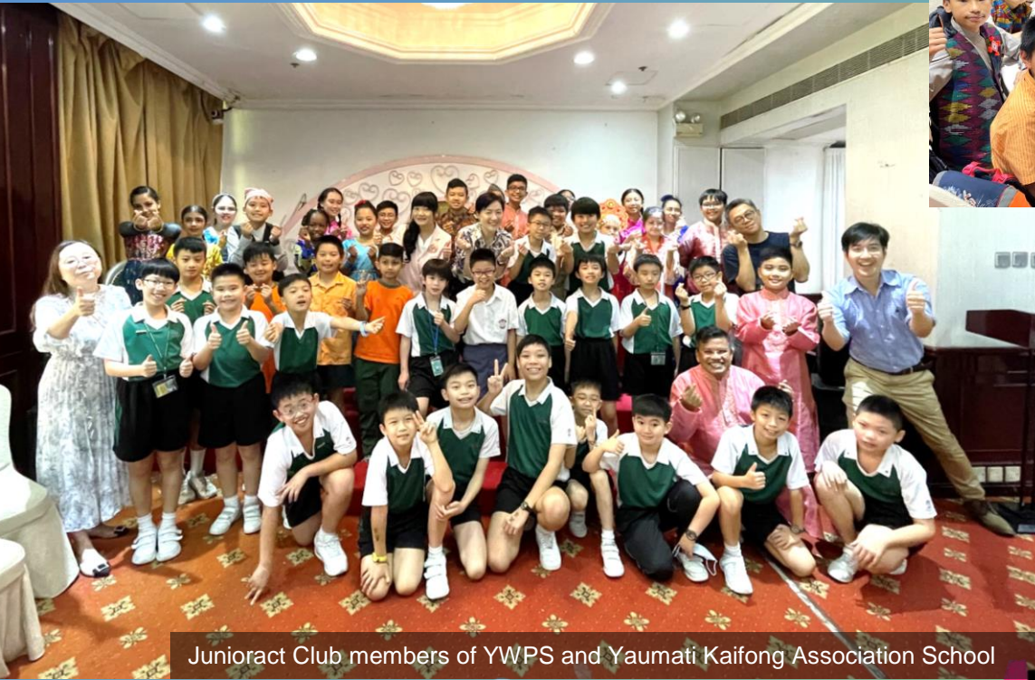
Junioract Club members of YWPS and Yaumati Kaifong Association School