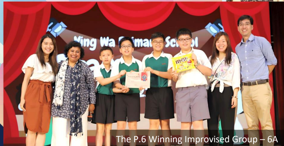
The P.6 Winning Improved Group – 6A