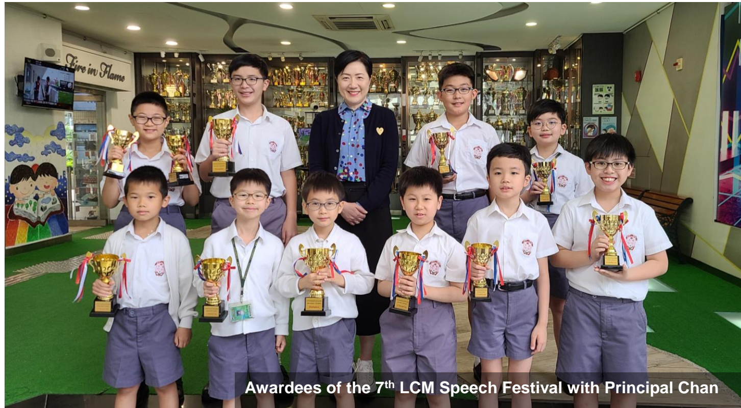
Awardees of the 7 th LCM Speech Festival with Principal Chan