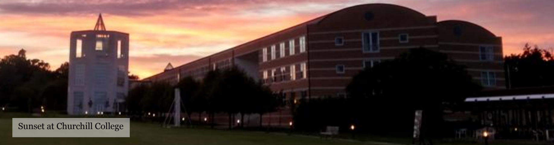
Sunset at Churchill College

Go online for the day-by-day reflections from our boys: http://englishywps.weebly.com/news/archives/08-2015