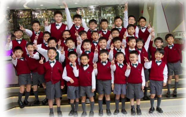
Second Place performers