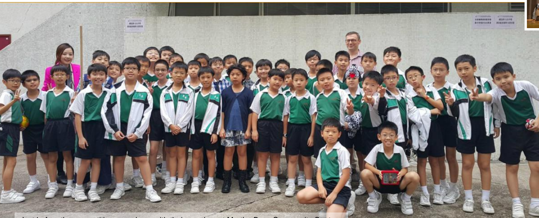
Just before the competition – our boys with their coaches at Martha Boss Community Centre