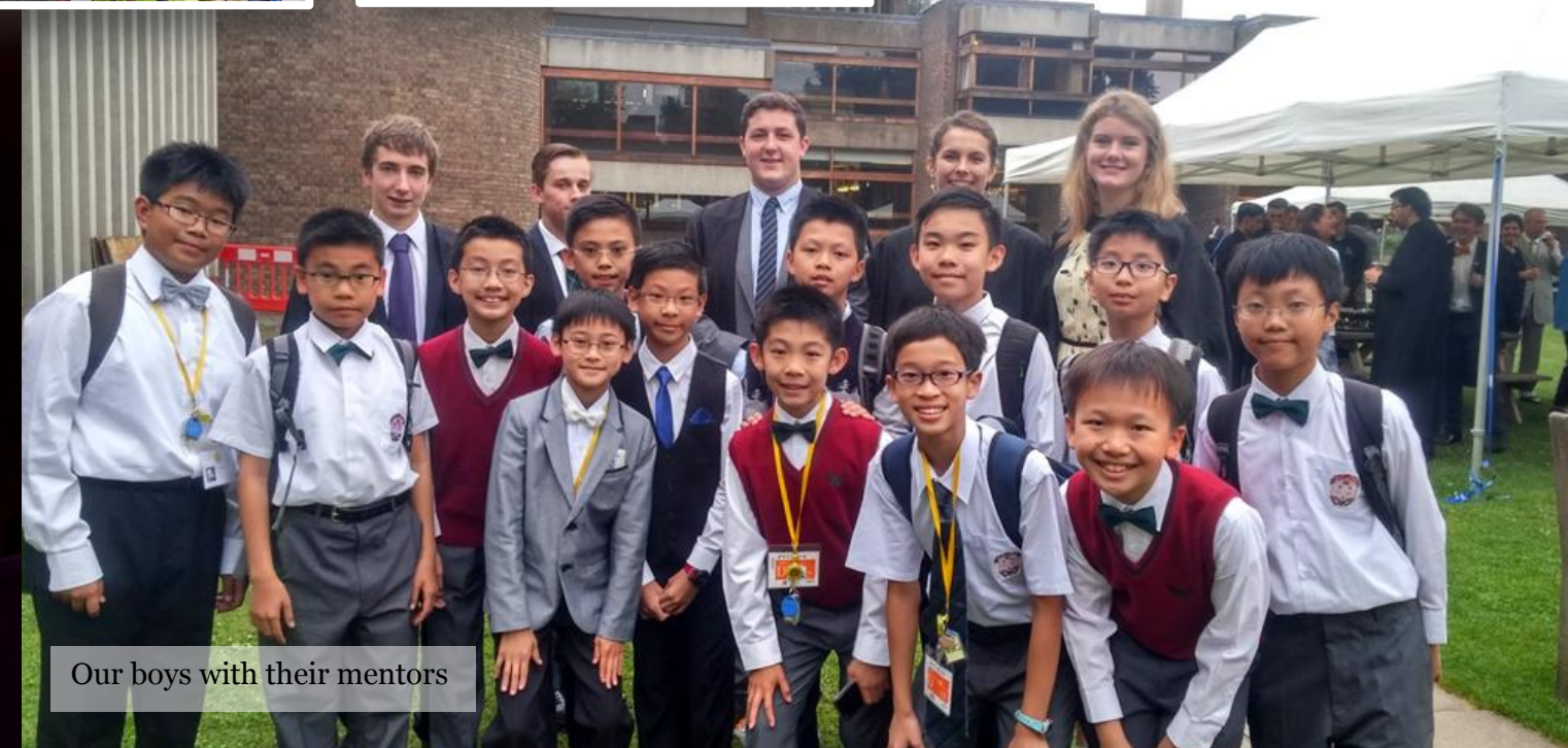
Our boys with their mentors