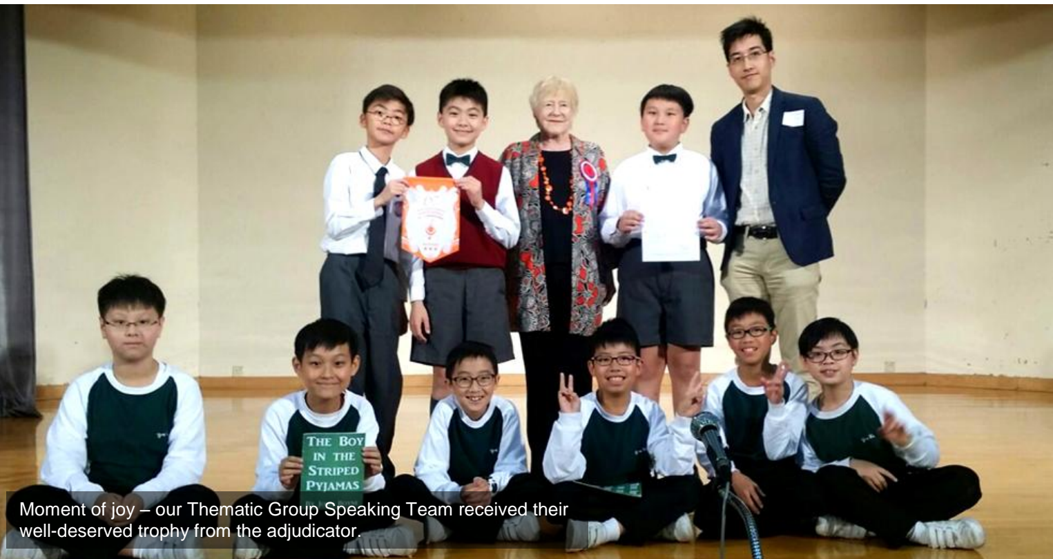
Moment of joy – our Thematic Group Speaking Team received their well-deserved trophy from the adjudicator.