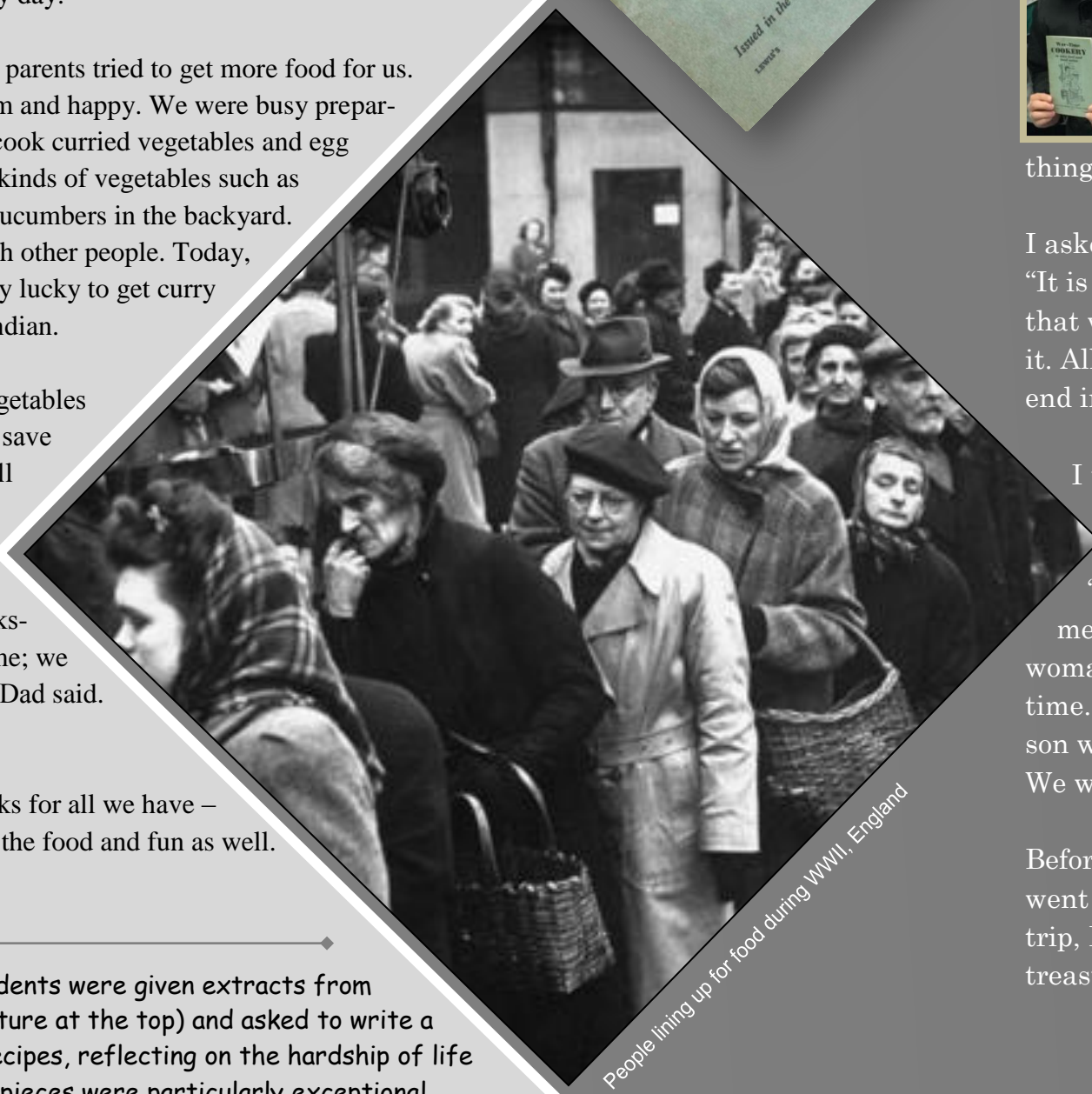
People lining up for food during WWII, England