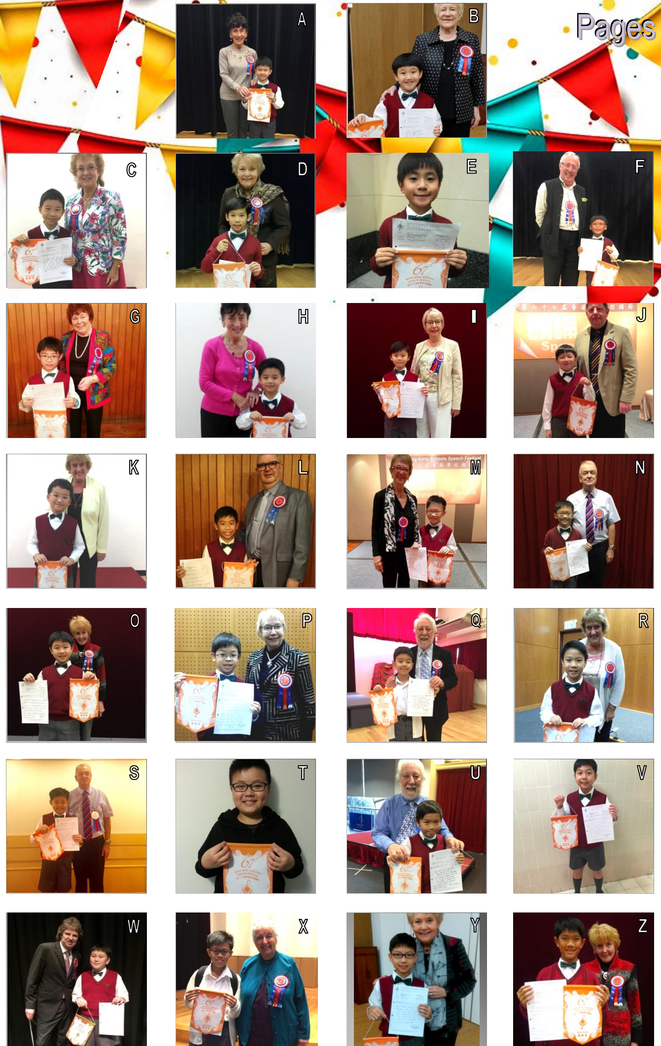
Individual Winners with their trophy