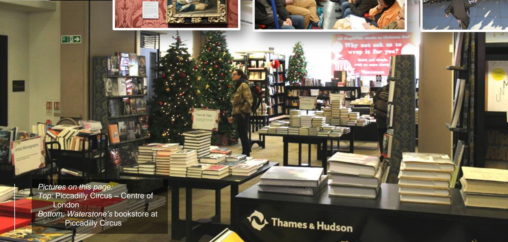
Pictures on this page: Top: Piccadilly Circus – Centre of London Bottom: Waterstone's bookstore at Piccadilly Circus